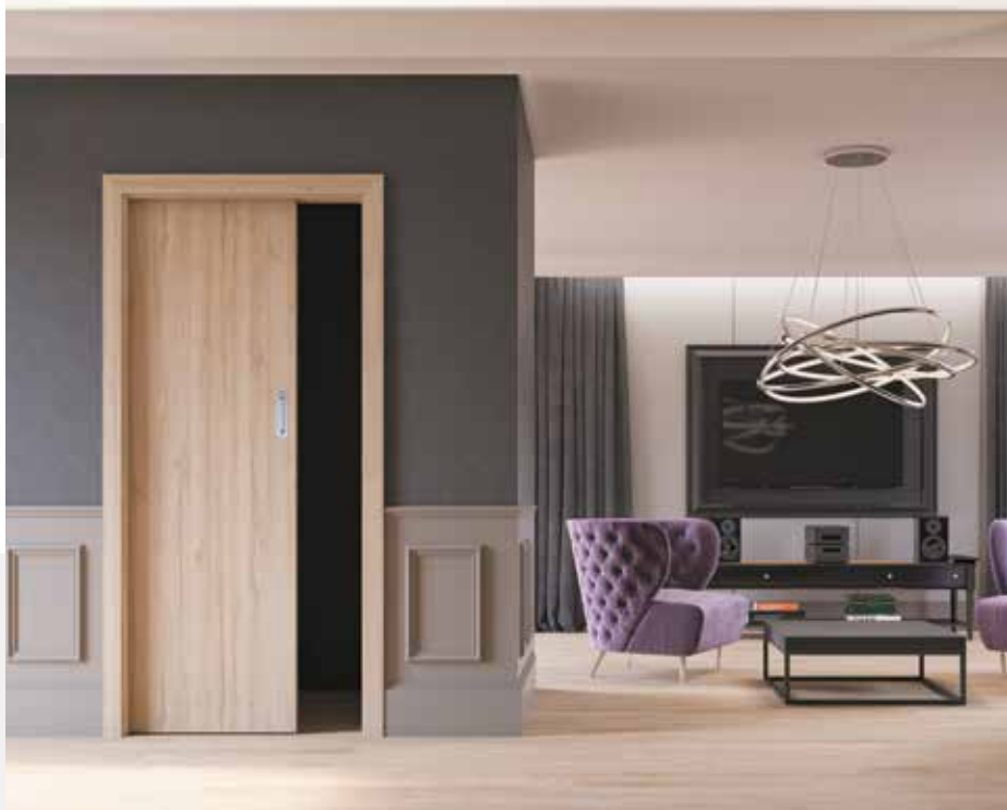
PA sliding system doors hidden in the wall (pocket system) - STANDARD 10 vintage oak