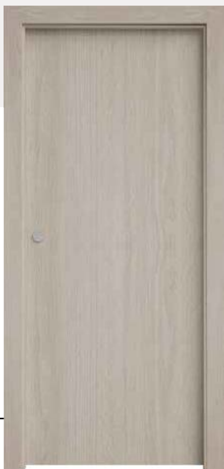
STANDARD 10 - PA cassette sand oak