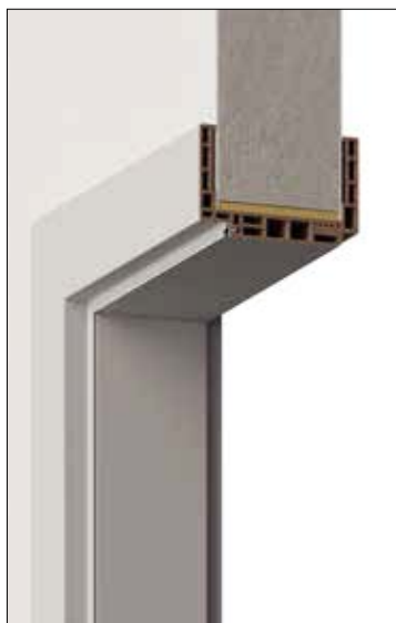
Horizontal section of Waterproof door frame (OR)